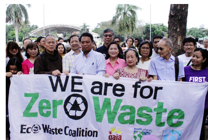
Environmental stewards came together during the Zero Waste Fair in Luneta, Manila.

the cooperation of technical experts from Health Care Foundation Nepal and HCWH Global, the Medical Waste team conducted a feasibility study on vermicomposting hospital diapers at the St. Paul Hospital Cavite. As part of the organizing committee of Zero Waste Month in the Philippines, the campaign showcased sustainable waste management practices.