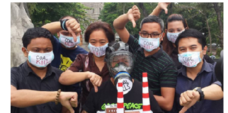
The Healthy Energy Initiative took part in the publication of a Greenpeace-Harvard report that analyzed the impacts of coal plants in the Philippines.

The GGHH Asia community has become more vibrant than ever. Members from different countries met face to face at the Green Hospitals Asia Conference. They demonstrated their commitment to environmental sustainability with over 21 case studies published this year. These case studies documented the implementation of sustainability projects on various GGHH sustainability goals. Four webinars, three in English and one in Bahasa Indonesia, had hundreds of audiences from different continents to learn about the work of GGHH in Asia, including renewable energy in health care, green procurement, and sustainable health care waste management.