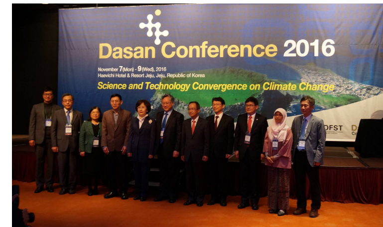
HCWH Asia joined international scientific experts in Dasan, Korea for the Science and Technology Convergence on Climate Change.