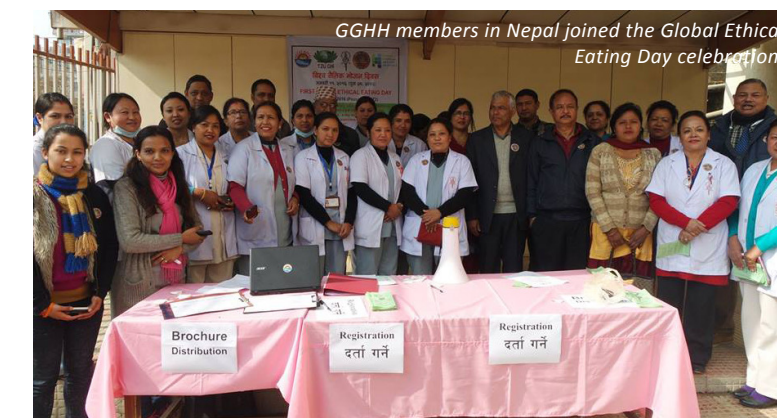
GGHH members in Nepal joined the Global Ethical Eating Day celebration.

Pushing for low-carbon and climate-resilient health care was at the core of HCWH Asia's work in 2016. In regional and international gatherings of policy makers such as the World Health Organization's 4th Global Forum on Health and Environment in Manila and the 9th Global Health Promotion Health Conference in Shanghai, HCWH Asia pushed for strengthening health care's capacity to mitigate climate change, in relation to advancing the Sustainable Development Goals.