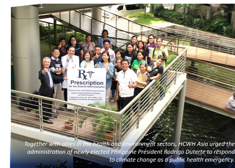
Together with allies in the health and environment sectors, HCWH Asia urged the administration of newly elected Philippine President Rodrigo Duterte to respond to climate change as a public health emergency.

Pushing for low-carbon and climate-resilient health care was at the core of HCWH Asia's work in 2016. In regional and international gatherings of policy makers such as the World Health Organization's 4th Global Forum on Health and Environment in Manila and the 9th Global Health Promotion Health Conference in Shanghai, HCWH Asia pushed for strengthening health care's capacity to mitigate climate change, in relation to advancing the Sustainable Development Goals.