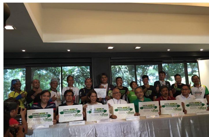
Together with various green groups, HCWH Asia called on candidates in the 2016 Philippine Presidential elections to discuss their environmental sustainability platforms.

As part of the Philippine Movement for Climate Justice, HEI took part in roundtable discussions and forums urging the government and various sectors to consider the health implications of energy sources. In the report "Coal: A Public Health Crisis," published by Greenpeace Philippines, HEI emphasized the negative health impacts of coal-fired power plants in communities. HEI also continues to build its work on the ground through educational workshops in communities hosting coal-fired plants. These workshops informed and educated health workers, government officials, and community members on the hazards of coal.