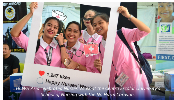
HCWH Asia celebrated Nurses' Week at the Centro Escolar University's School of Nursing with the No Harm Caravan.

The Medical Waste campaign explored more sustainable and safe alternative waste management solutions by working closely with hospitals and health facilities. With