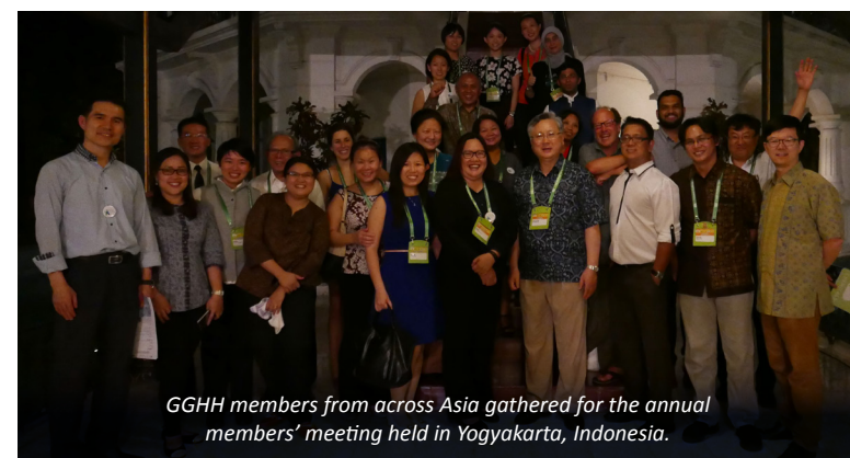
GGHH members from across Asia gathered for the annual members' meeting held in Yogyakarta, Indonesia.

In March, HEI hosted a workshop on conducting Health Impact Assessments (HIA) for energy policies and projects. The workshop was attended by over 50 researchers, policy-makers, and advocates in public health, energy, environment, law, finance, and economic development. They learned the principles and processes of HIA as well as discussed the challenges and opportunities in the use and institutionalization of HIA in the Philippines and across the globe.