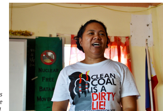
The Healthy Energy Initiative works with residents coal-hosting communities in Bataan to educate them about the health impacts of coal.

The Healthy Energy Initiative contributed to the Greenpeace Southeast Asia report Coal: A Public Health Crisis. Diseases and deaths attributed to coal use in the Philippines which was published in February. The report revealed the health impact of existing coal-fired power plants in the country and why renewable energy is the way to go towards a clean, sustainable, and healthy energy future.