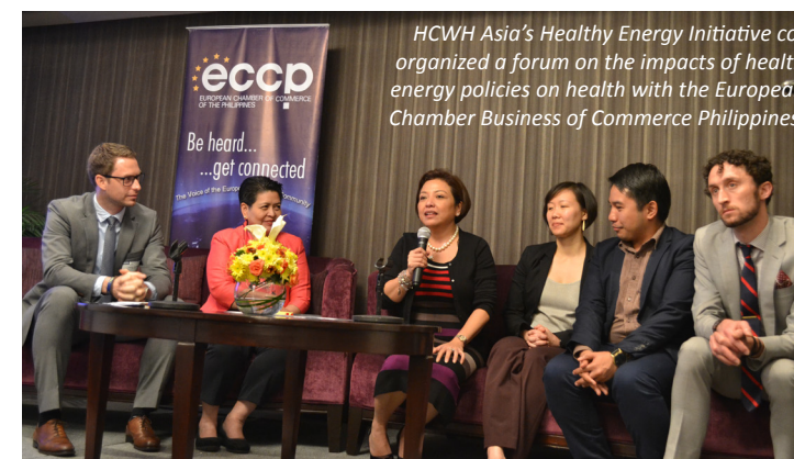
HCWH Asia's Healthy Energy Initiative co-organized a forum on the impacts of health energy policies on health with the European Chamber Business of Commerce Philippines.

The campaign also actively worked with local and international networks advocating green solutions to the waste problem. The EcoWaste Coalition, the Global Plastic Alignment Movement, and Green Thumb Coalition brought environmental issues to the forefront during the 2016 Philippine Presidential Elections.